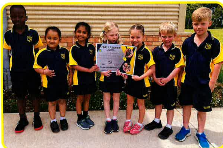
Well done K/1 for your picture book